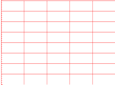
FIG.1: Maximum power dissipation versus RMS on-state current