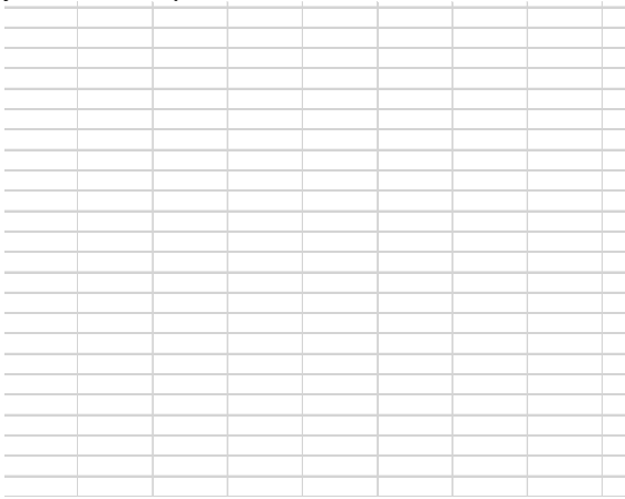
FIG.7: Relative variations of gate trigger current, holding current and latching current versus junction temperature