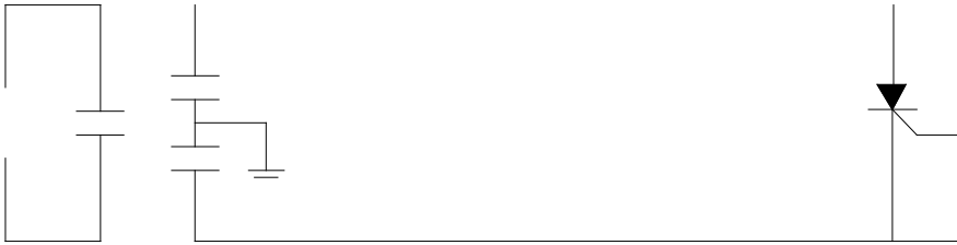
FIG.7 ÖTest circuit for inductive and resistive loads to IEC-61000-4-5 standards.