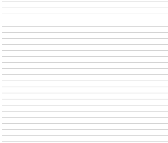
FIG.1: Maximum power dissipation versus RMS on-state current